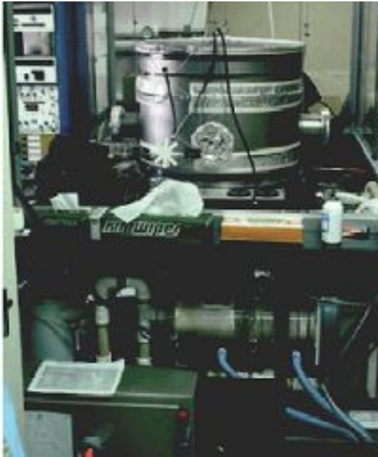
A test lab for PV production showing protection measures for handling small amounts of silane gas. Note the perspex scrubber below the tank

While the use of cadmium is banned or limited in many instances, particularly where it is hard to recycle or take care of, European Union regulations do not currently prohibit its use in photovoltaic cells, since it is in a stable non-metallic form (typically CdTe), and is not soluble in water.