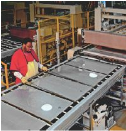
Staff working with cadmium telluride are monitored routinely to ensure that they experience no harmful side effects FIRST SOLAR

Various dangerous caustic chemicals such as hydrofluoric acid (HF), nitric acid (HNO 3 ) and sodium hydroxide as used to clean the silicon wafers and remove any oxidized residue. While such chemicals are extremely hazardous on contact or if released into the water system in large quantities, their use in industrial applications is routine and safety measures are well established.